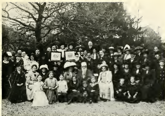
ABDUL BAHÁ WITH SOME BAHÁIS IN STUTTGART